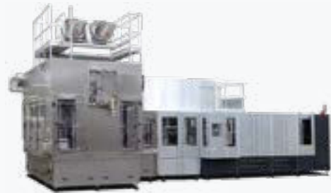
Combi Quatro Care Blower / Filler / Capper

► Efficiency & unrivaled filling accuracy