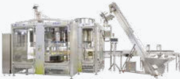
Hema Quatro Access Filler / Capper Monobloc