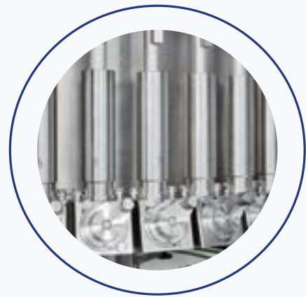
Hema Volufill Filler for jam