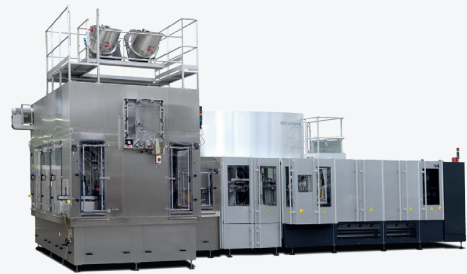
Combi Quatro Care Blower / Filler / Capper

► Efficiency & unrivaled filling accuracy