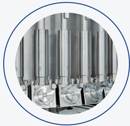
Hema Volufill Filler for jam