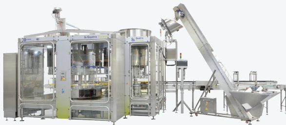
Hema Quatro Access Filler / Capper Monobloc