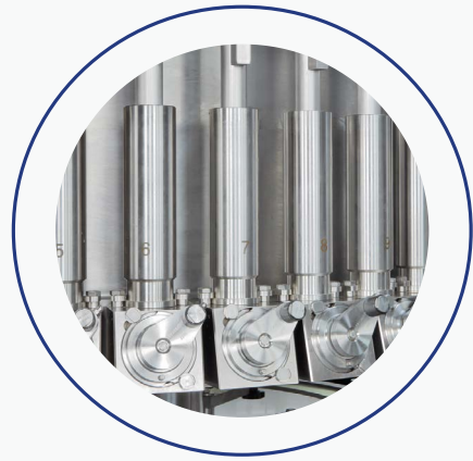
Hema Volufill Filler for jam