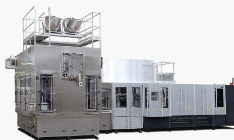
Combi Quatro Care Blower / Filler / Capper

► Efficiency & unrivaled filling accuracy