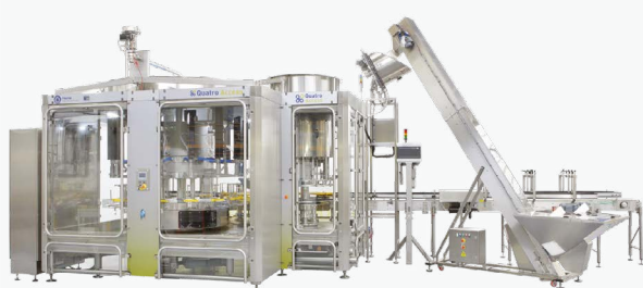
Hema Quatro Access Filler / Capper Monobloc