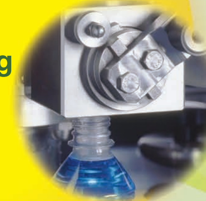
Filling nozzle MV rotary volumetric