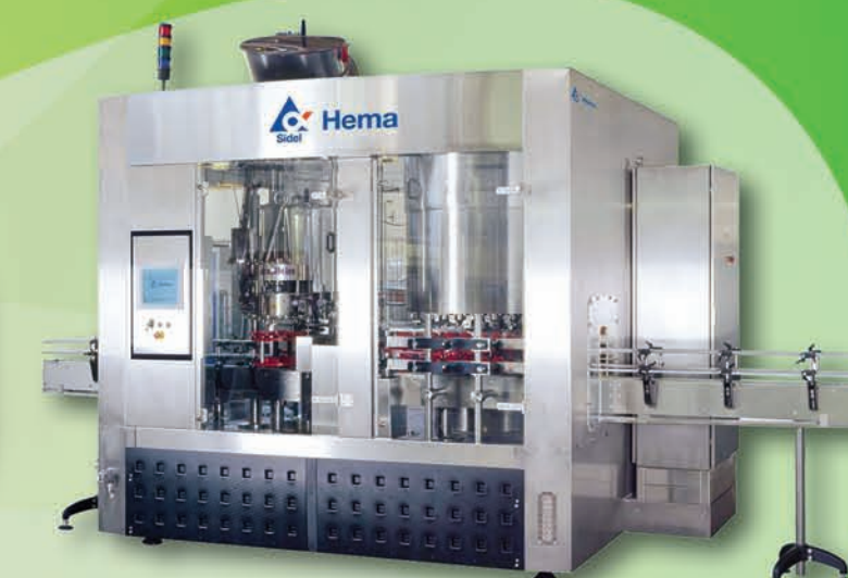
GW Rotary Monobloc Net Weight Filler + Capper