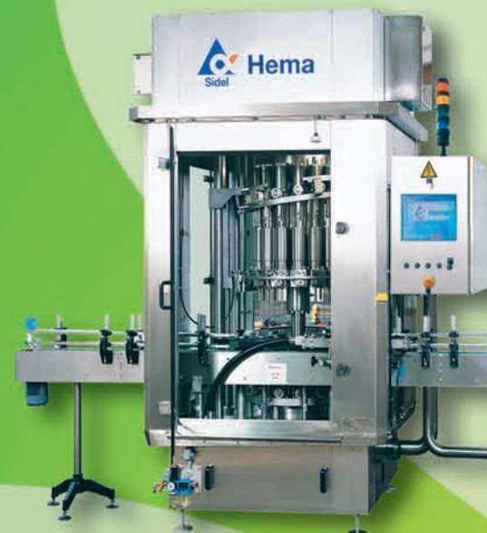
MV Rotary Volumetric filler