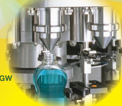
Filling nozzle GW net weight