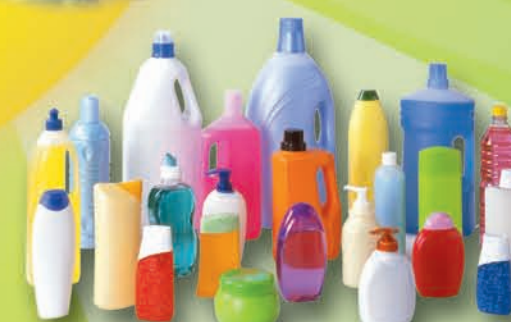
Home Personal care