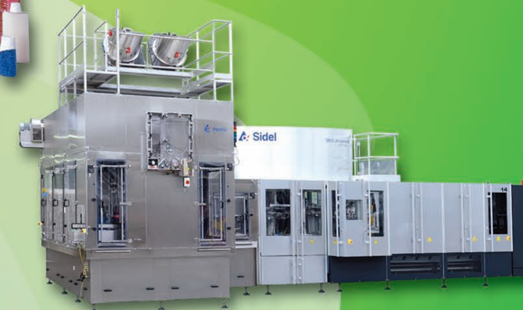
Combi GW Sidel Blower + Hema Filler-Capper on the same platform