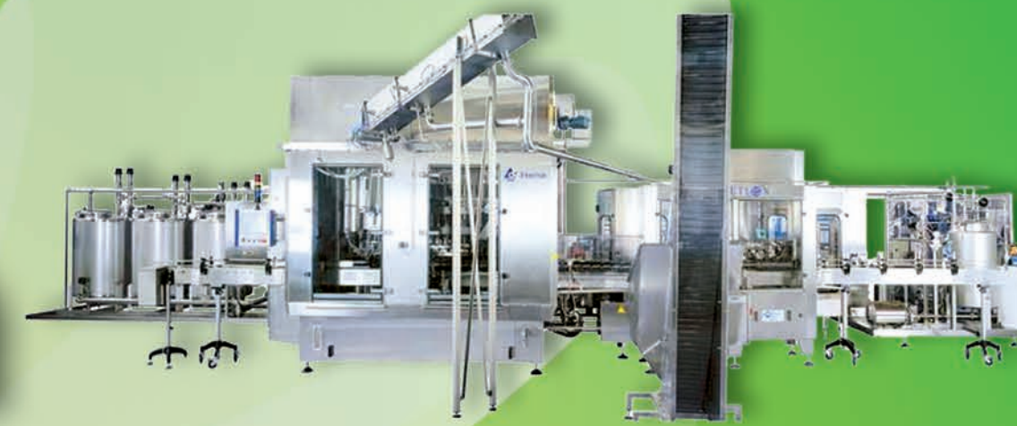
Integrated solution Rinser + Filler + Capper