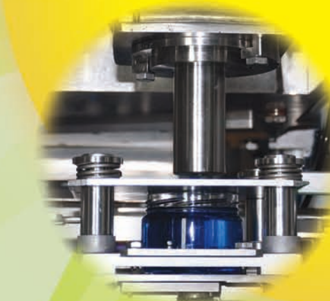
Filling nozzle MV in-line volumetric